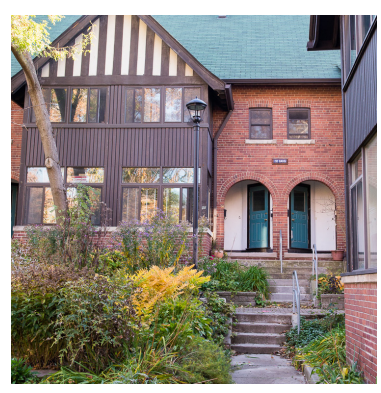
Bain Apartments Co-operative, Toronto

"As a new co-ordinator, I have been very happy with the support and guidance provided by the co-op's relationship manager. She has always been available to answer questions and/or research the information needed to assist. I have found this to be a very valuable resource and support and very much appreciate the support provided."