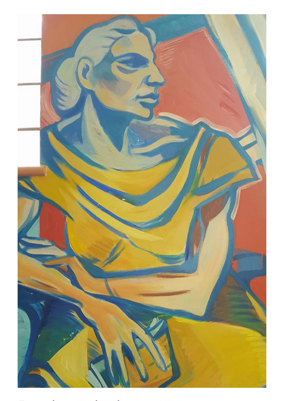
From the mural in the meeting room of Four Sisters Housing Co-operative, Vancouver

More than 130 Agency clients to date have attended an Agency presentation that explains what changes and what remains the same when an operating agreement concludes. As much as possible, we try to deliver the presentation in partnership with a co-operative housing federation to emphasize that ongoing assistance will continue to be available from that quarter.